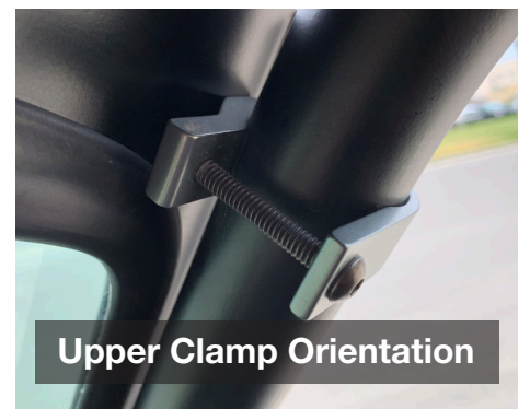
Upper Clamp Orientation

STEP FOUR – Place the billet clamps on the frame in the approximate locations and tighten with the 2" bolts enough to hold in place but still allow slight movement. Bolt the windshield to the clamps using the \frac{1}{2} " bolts and flat washers. Adjust windshield to desired location and tighten all the bolts.